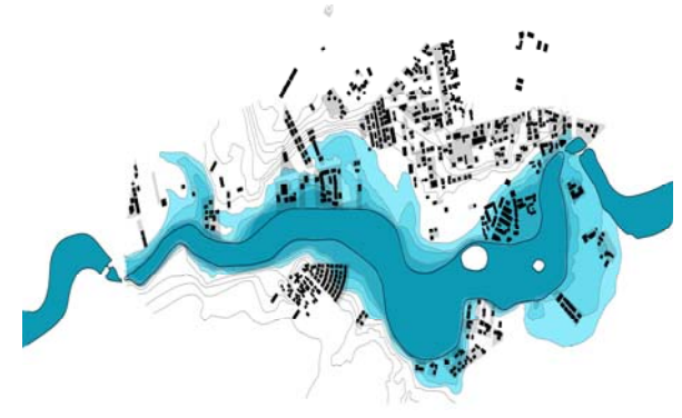
Figure 2. Urban issue and flood-plain

As known, green corridors have an important ecological role. It is highly recommended to have trees in the built areas for multiple reasons. On the other side, we suggest to extend this corridors on the agricultural area also, not only because of the ecological purpose, but also for the benefits they bring to cultures.