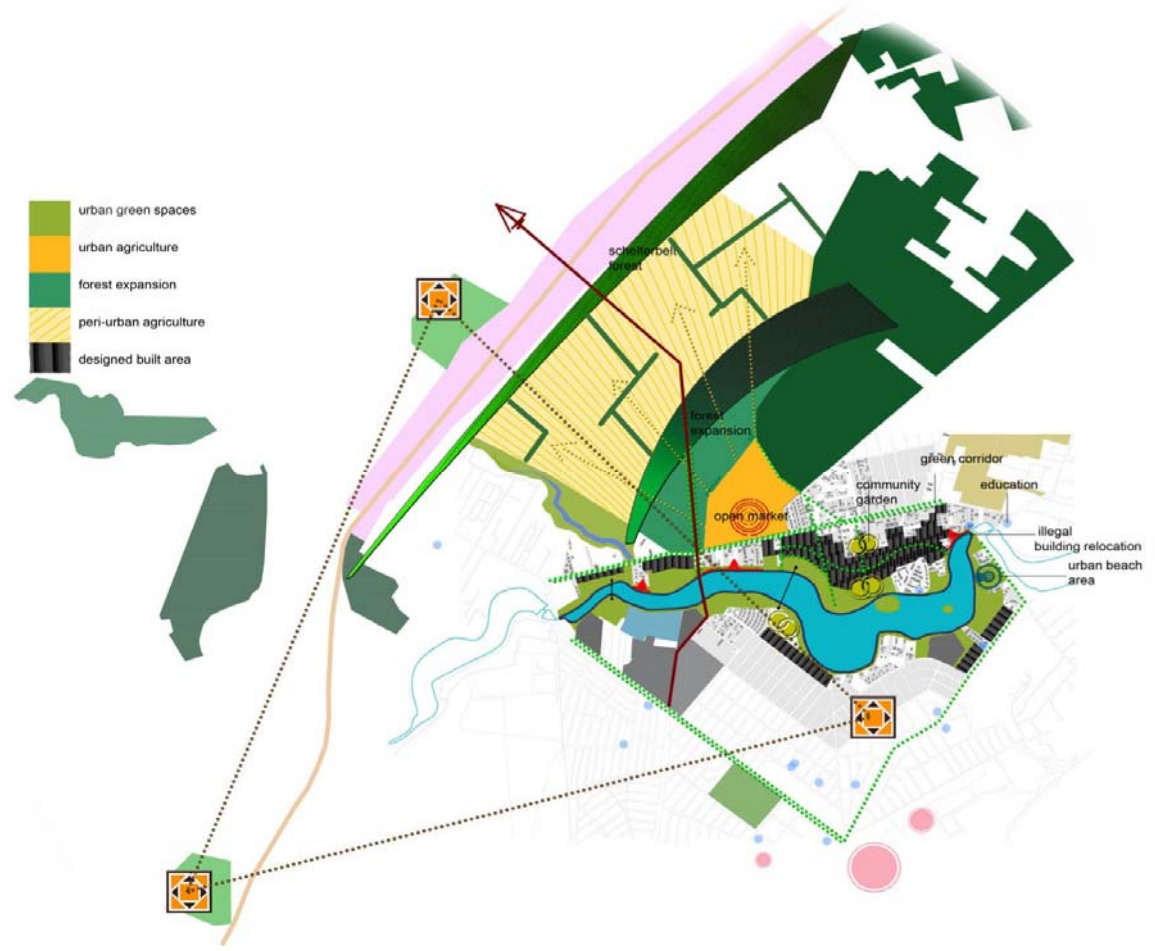
Figure 3. Strategy for the detailed area

The presented changes are suggested in the strategy plan (Figure 3).