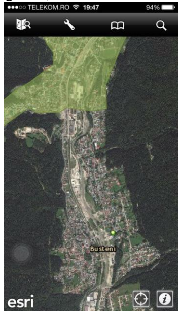
Figure 2. ArcGis Online. Map seen from IOS mobile device

We can also use the mobile devices to collect points from a certain area, for example if we want to have a map with the places where a certain flower grows in the park nearby we can go there with any mobile device and use Collector for ArcGIS aplication to put them