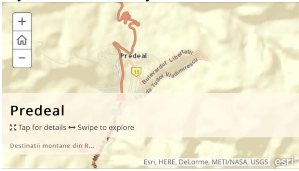
Figure 5. StoryMap seen from IOS device

that difficult, there are some things to consider before making a decision. We need think about the cost, about the accommodation, about the distance between where they live and where they need to go and about what activities they can do once they get there. The cost of the trip is obviously one of the most important things to consider, so in the analysis of each possibility that will be the main criterion. After we collect all the informations that we need and take into consideration what we want to obtain, we will have a StoryMap that can be easily understood by anyone, that can be presented in just a few seconds anywhere and from any device.