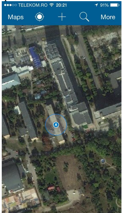
Figure 3. Collector for ArcGIS aplication on IOS device

The map can be shared with everyone, so it's also very usefull as a way of transmiting information. After we added all the points and informations on the map and also saved it, we need to find a way to present it. A simple way is to create a StoryMap.We can do this by going to www.storymaps.arcgis.comand follow some simple steps. A StoryMap combines maps created using ArcGis Online with any multimedia content like videos, photos, text etc. So a StoryMap lets us present all kind of informations about places while seeing those places on an interactive map. There are many StoryMap templates and we can even create a custom template wich suits our needs. A basic template consists of a side pannel and a main scene. In the side pannel we can put any kind of information like text, videos, photos, links to different sites. The side pannel has a few sections, each one providing informations about a certain place on the map. In the main scene we can import the map that we created using ArcGis Online or a map created by anyone with an ArcGis acount so this is very helpful if you want to use different maps for different locations.