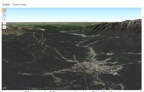
Figure 6. 3D scene in ArcGis Online

Also the technology is rapidly evolving, so very soon the map used to identify our interest points will not be just a 2D map, it will be a 3D map containing possibly even a rough representation of the buildings in the area. That will make a huge difference in the perception of the space around our interest and will definitelyimprove understanding of the geographical location for a certain place.