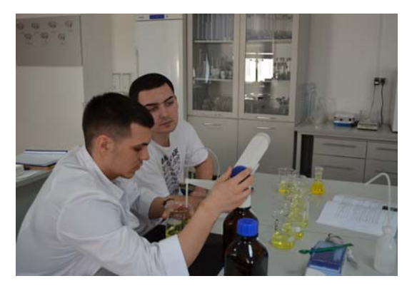
Figure 11. Determining the chlorine using the titrimetric evaluation