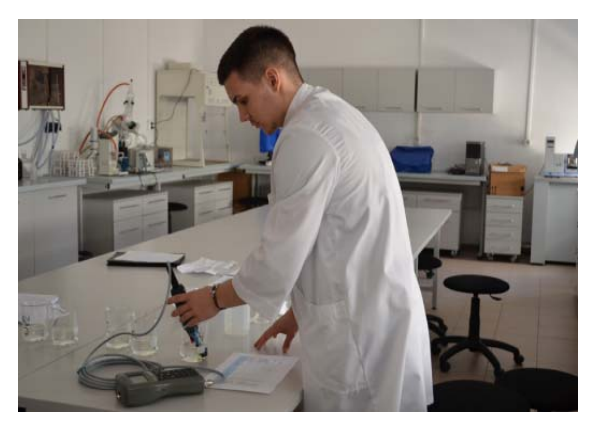
Figure 7. Laboratory measurements of pH, conductivity and dissolved oxygen

At first, the probe is immersed in the sample, then easily moved in a circular pattern (2-3 times) until the value displayed by the device stabilizes, followed by the data recording (Figure 7).