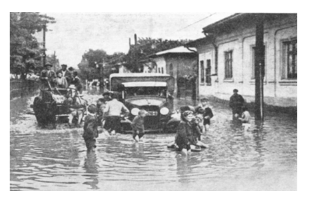
Figure 3. The effects of Colentina's drainage on Bucharest and the surrounding areas (Caranfil, 1963)

Colentina's water was used in Bucharest for fish breeding, agriculture irrigations and recreational events (Figure 4), (Giurescu, 1979; Caranfil, 1936)