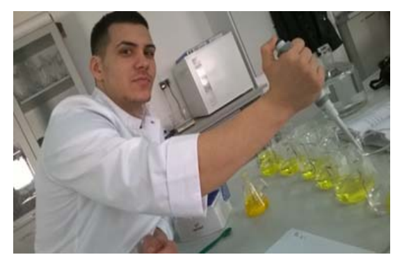
Figure 10. Determining the chlorine using the titrimetric evaluation