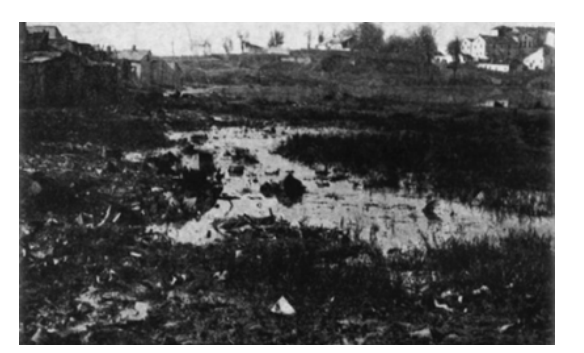
Figure 1. Floreasca's pit before development (Caranfil,1963)

In the last 60 years, important hydro-technical projects were implemented along the river's stream, projects that transformed the little mosquito infected river with poor neighborhoods along his sides (Figures 1,2,3) into a chain of lakes with multiple and popular recreations areas. (Giurescu, 1979).