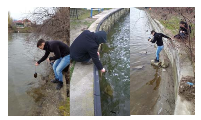
Figure 5. Collecting water samples

For our tests, we collected water samples from the 4 lakes (Grivita, Baneasa, Herastrau and Floreasca), from upstream to downstream, in March 2015 (Figure 5).