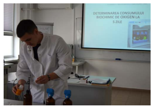
Figure 9. Determining the CBO of the water samples

The biochemical consumption of oxygen is determined with the help of incubation, in dark, at 20oC with the BDO5 Velp Scientifica device together with the proper accessories (Figure 9).