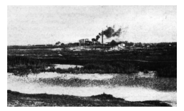
Figure 2. Herastrau Lake, 1935 (Caranfil, 1963)