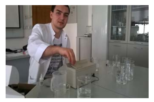
Figure 8. Determining the turbidity with a high precision stationary turbidity meter

The turbidity of the samples was determined using a stationary turbidity meter HI 88713. The device has a high precision, being able to provide accurate values in Nephelometric Turbidity Units (NTU). As steps, we first filled a 10 ml container with one of the water sample and placed it afterwards in the turbidity meter; closed the cover, pressed the "READ" button and after approximately 10 seconds we can record the data written on the display's device (Figure 8).