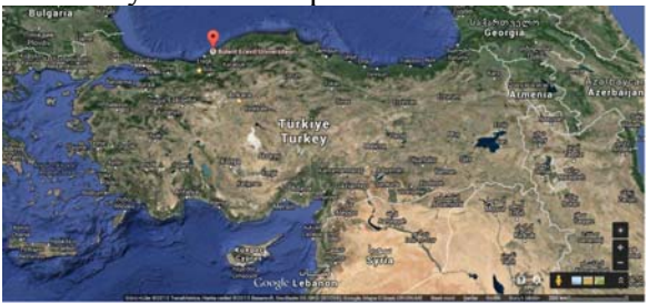
Figure 2. Sampling point

To determine particulate matter amount, sapling point was selected at Bulent Ecevit University Farabi Campus.