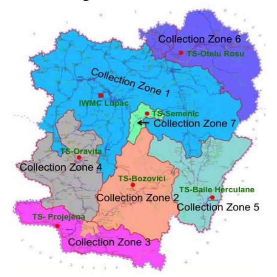
Figure 2. Waste collection zones in Caraş-Severin county

In order to collect waste, according to the County Waste Management Plan, one assigned to Caraş-Severin county 7 collection zones, presented in figure 2.