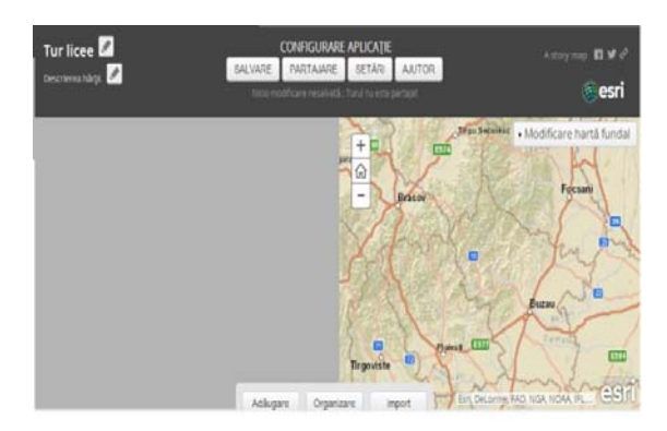
Figure 3. Initial version of the application (http://www.arcgis.com-screen shot)

We have created a "Map Tour" application based on aforesaid map keystone. Following these steps, unprocessed version of the application looks as shown below (Figure 3).