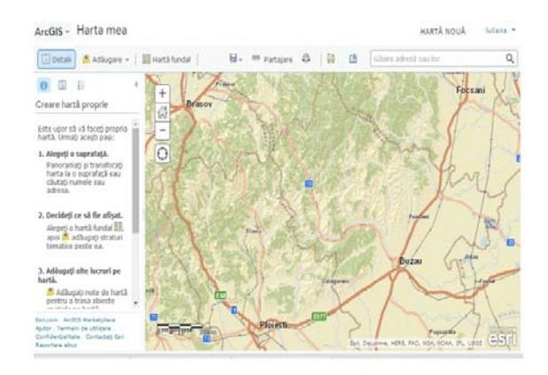
Figure 2: Map Keystone (http://www.arcgis.com –screen shot)

http://www.arcgis.com site. After that we have created trapezius map we were interested in then we have added thematic layers to her and the final step in this stage was to save the result (Figure 2).