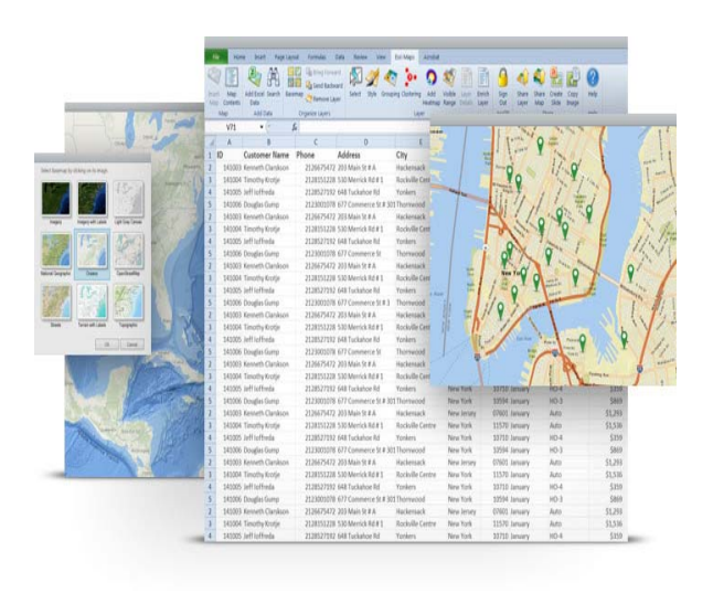
Figure 6: Esri Maps for OFFICE (http://www.esri.com)

In addition, this service can be used by people who are not specialized in this area, such as: web creators who combine geographic content and tools to build web pages and apps with the data, people without GIS software or training, geographic information specialists for sharing detailed data, analysis models, and tradecraft / workflows with one another, as well as with the broader community, system architects and developers who need to integrate mapping and geographic functionality in their solutions. Also this application could be created in "Esri maps for Office", another product implemented by Esri America that make dynamic maps of your spreadsheet data right in Excel. People can create color-coded, point, clustered point, or heat maps. Then they can share their maps through ArcGIS Online or copy them into your PowerPoint presentation or document. They can also create an organization and share the information only in this. The only difference between the two ways of creating the application is that in "Esri maps for Office" data are entered into an Excel table (which contains fields: name, caption, color IC, main picture URL, miniature URL and coordinates) and then insert this table in "ESRI maps for Office". (Figure 6)