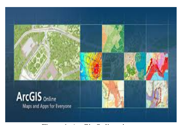
Figure 1. ArcGis Online picture

Even the steps for creating this application are relatively simple; the later stage of collecting information, namely their introduction in the main system and achieve attractive graphical interface that is easy to use, is not an easily followed to go and completed without the necessary knowledge. To create this application, we used ArcGIS platform which has an online version (Figure 1) used by Gis professionals to manage and share their apps and geographical information.