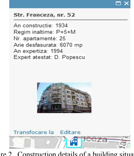
Figure 2. Construction details of a building situated on Franceza St, 52

The addresses published by the Bucharest City Hall was located on the map, and on the ArcGIS platform we added pictures of the buildings and construction details of them (e.g. construction year, height, number of apartments, area, year of expertise, certified expert) (Figure 2).