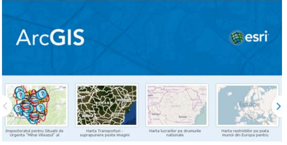
Figure 1. ArcGIS.com website screenshot

The chosen GIS platform was ArcGIS developed by ESRI, the free online version (http://arcgis.com) (Figure 1).