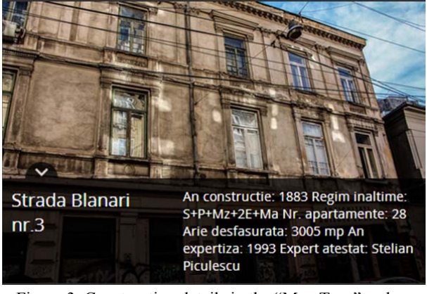
Figure 3. Construction details in the "Map Tour" web application

For the final export we chose the "Map Tour" web application available in the "Share" option of ArcGIS.com website.