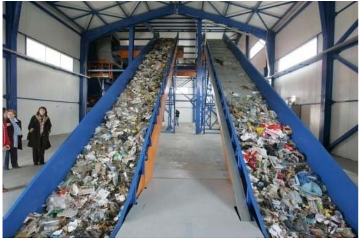
Figure 3. Waste sorting and transfer plant

For example: Slovenia leads the leaderboard with a degree of recycling 55% of municipal waste; Germany ranks second after Slovenia with a 47% recycling rate and preserving the performance of 0 percent for disposal in landfills (alongside Switzerland) (Ecoteca, 2015).