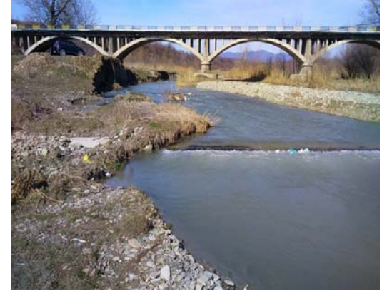
Figure 1. Teleajen riverbed

These deficiences were caused by a serie of natural characteristics of the Teleajen river (high speed flow, large longitudinal slope), as