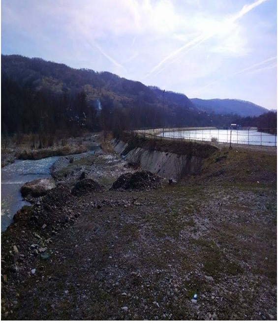
Figure 2. Deep erosions on longitudinal dike of the polder

In these conditions, the bank defense must be realized using a technical solution as simple and efficient as possible – resistant, elastic and stable to the hydraulic influences of the river stream, as well as easy to build up. The technical solution is applied both in plan and in longitudinal path, the characteristic section consists of executing a section of recalibrated