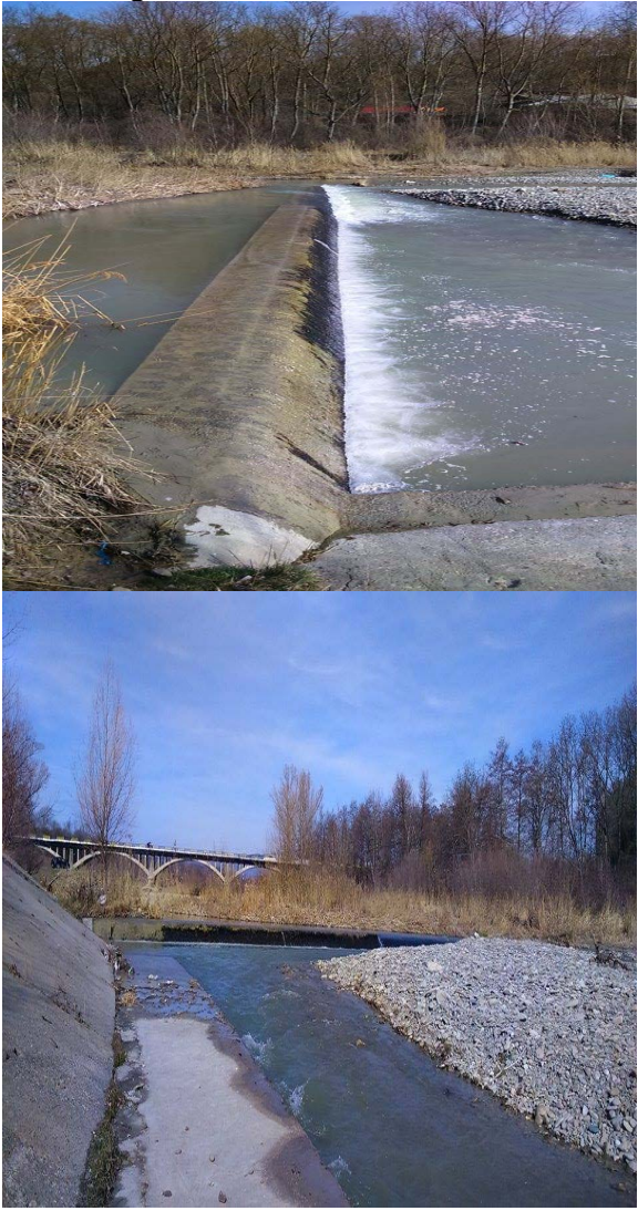
Figure 3. Concrete thresholds

and protected riverbed on the left bank on a length of about 415 m with gabions, boxes 1.00 x 1.00 x 5.00 m and 1.00 x 1.50 x 5.00 m, above mattresses of gabions 3.00 x 3.00 x 5.00 m. This bank protection will be adapted in the connection section with the concrete thresholds. On the right bank adjacent to the uncovered buttress, will be assured the same elastic protection, but without the last row of gabion boxes. Gabion boxes will be made from concrete steel with diameter 16 mm and galvanized wire mesh, and will be filled with river rocks twice the dimensions of the enmeshing.